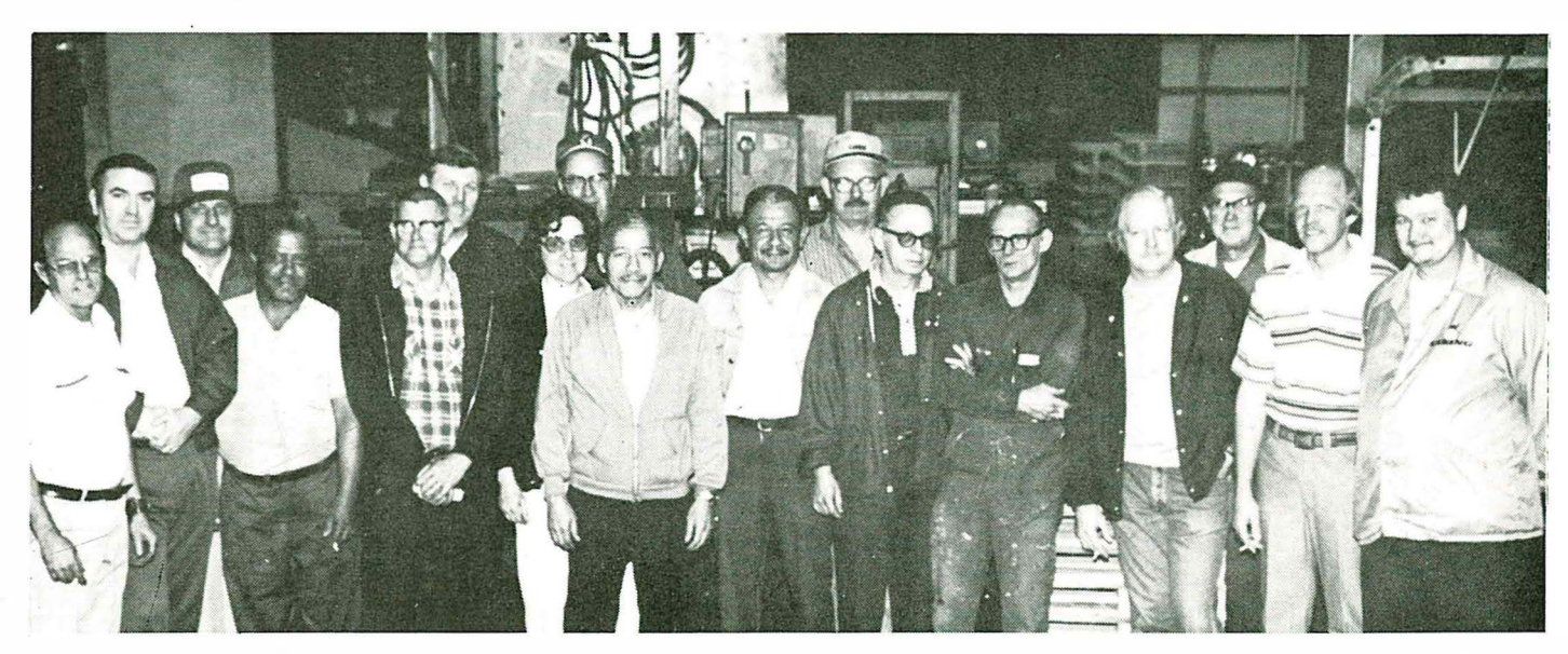
First place in the Safety First contest for the month of March was won by TEAM 8. Team 8 is comprised of personnel from Areas 1541, Superintendent's Office; 1543, Production Plant #2 and 1546, Metal Engineering.