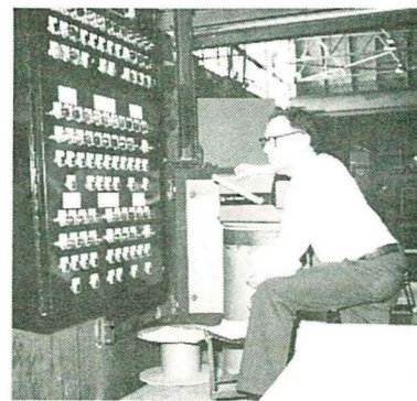
TEAM 8 TAKES FIRST PLACE . . .